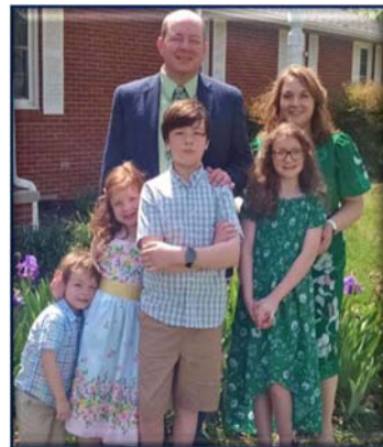
The Clark Family