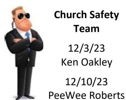
Church Safety Team 12/3/23 Ken Oakley 12/10/23